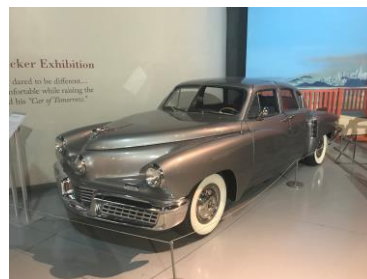
AACA MUSEUM COLLECTION

VCCA BBQ- Each year the Keystone Region of the greater Hershey area hosts a great BBQ at the Indian Caves attraction.