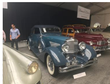
DUESENBERG AT THE RM AUCTION