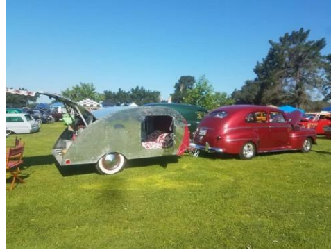
CARLOS' RIG ROLLING WITH THE BOMBERZ