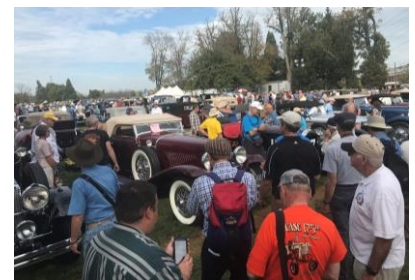
CAR SHOW ON THE FINAL DAY

Chevy Trivia- What year did the longest running Chevy model first appear and what was it? (see page 4 for answer)