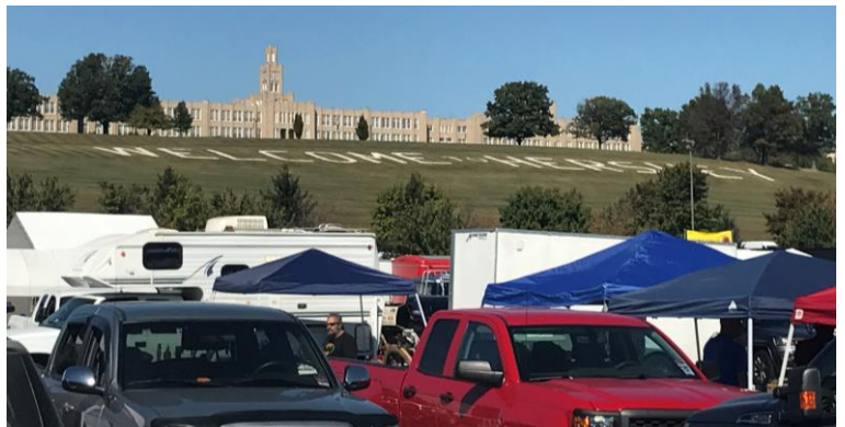
MILTON HERSHEY SCHOOL

the day they rolled off the line. And once again there is one of everything. Brass era cars, the original electrics, steam... you name it, I bet it is there.