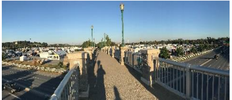
PANORAMA OF THE NORTHERN FIELDS

The final day, Saturday, is the AACA Fall Car Show. Now when I say "car show" I mean a real car show! There nearly 1000 vehicles, many of which are perfect, even better than