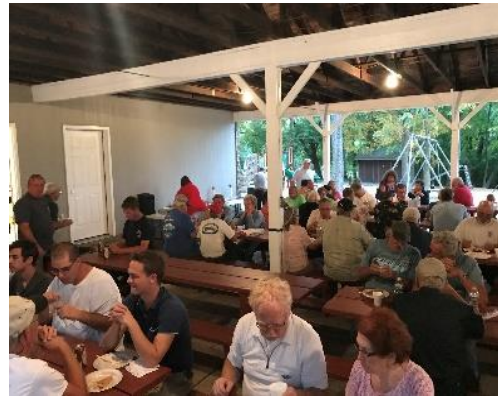
KEYSTONE REGION HOSTED BBQ

VCCA BBQ- Each year the Keystone Region of the greater Hershey area hosts a great BBQ at the Indian Caves attraction.